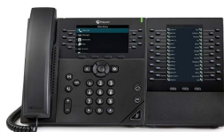
V VX-450 with side car